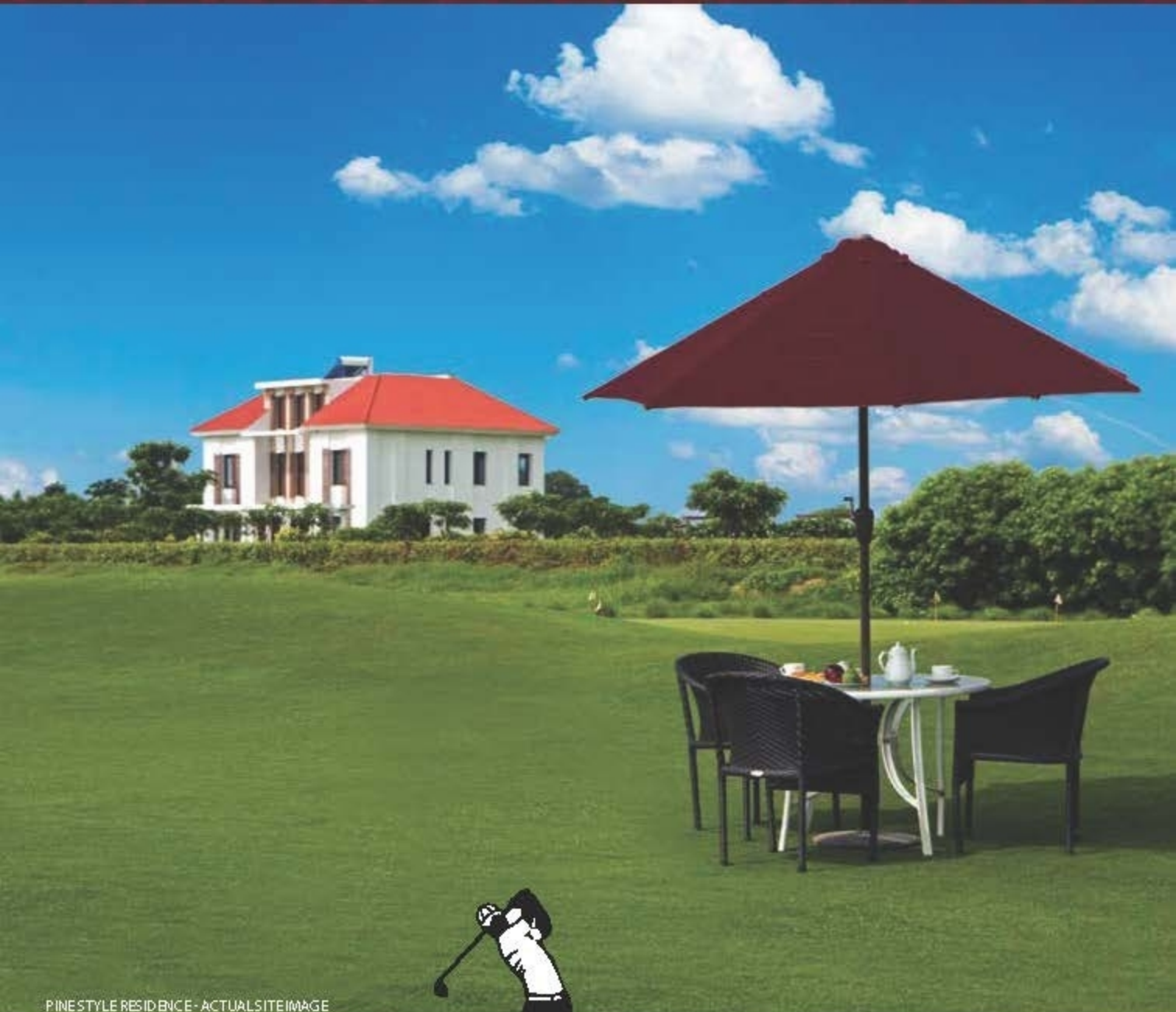
PINESTYLE RESIDENCE - ACTUALSITE IMAGE

A PROJECT BY MALHOTRA REALTY PVT LTD (MRPL) WWW.MALHOTRAREALTY.COM