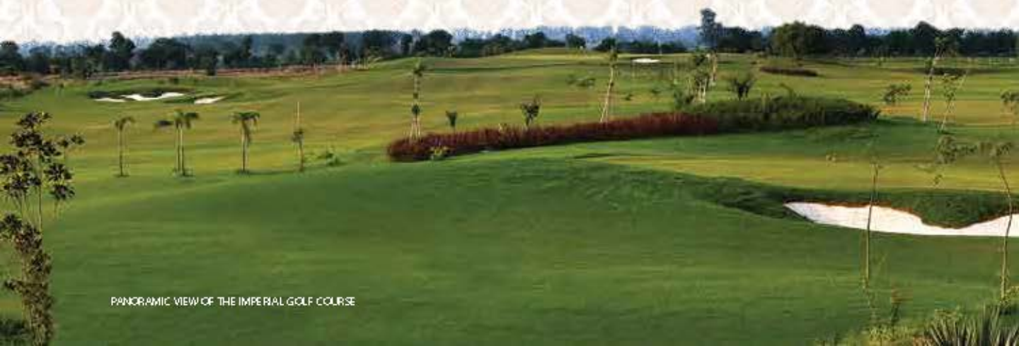
PANORAMIC VIEW OF THE IMPERIAL GOLF COURSE