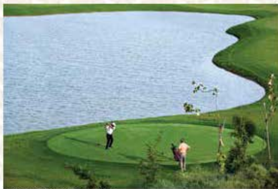
TEERING OFF ON THE 14TH HOLE

The making of a legend is always surrounded by an air of the impossible. Yet, stage by stage, through belief, heroic perseverance and imagination, a vision takes shape. This vision of The Imperial Golf Estate captures the rhythms of the land, the dreams of a generation, and the spirit of the age, and is on its way to creating a legend in world-class golfing.