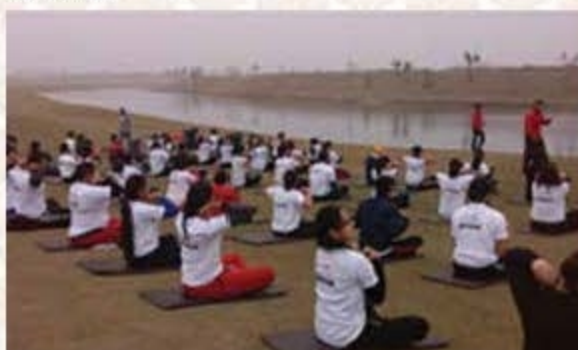
YOGA ON THE GREENS