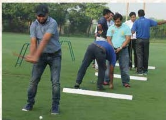
AT THE RANGE